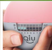
Upper casing: Biofeedback (red/green); blue LEDs: Target breathing rhythm