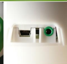
USB interface and socket for an external pulse sensor